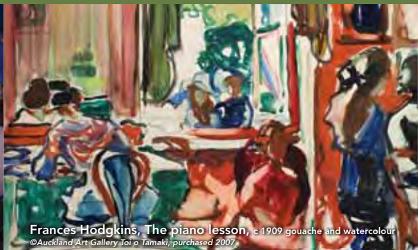
Frances Hodgkins, The piano lesson , c.1909 gouache and watercolour ©Auckland Art Gallery Toi o Tamaki, purchased 2007