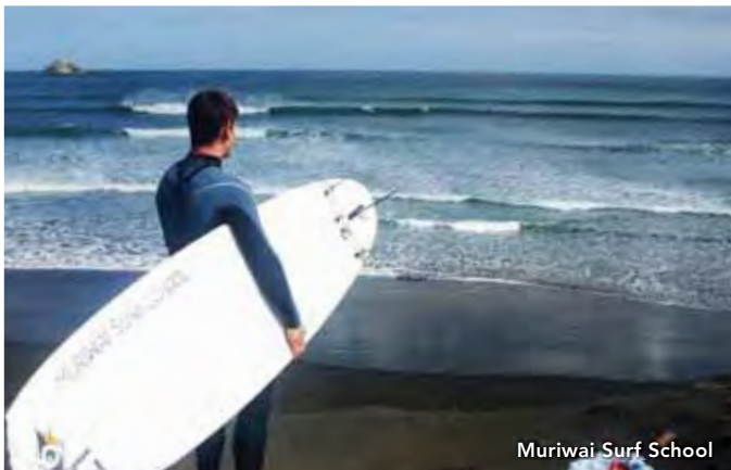
Muriwai Surf School