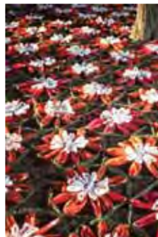
Sculpture in the Gardens