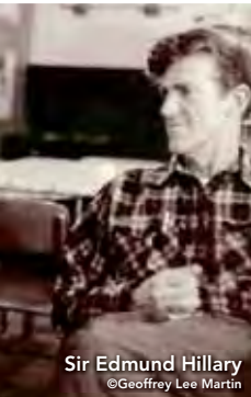
Sir Edmund Hillary