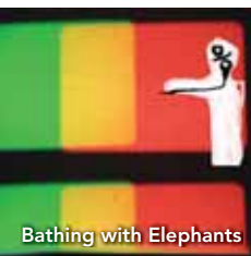
Bathing with Elephants