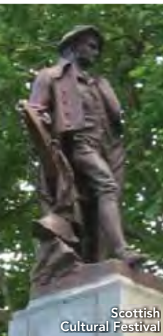
Scottish Cultural Festival