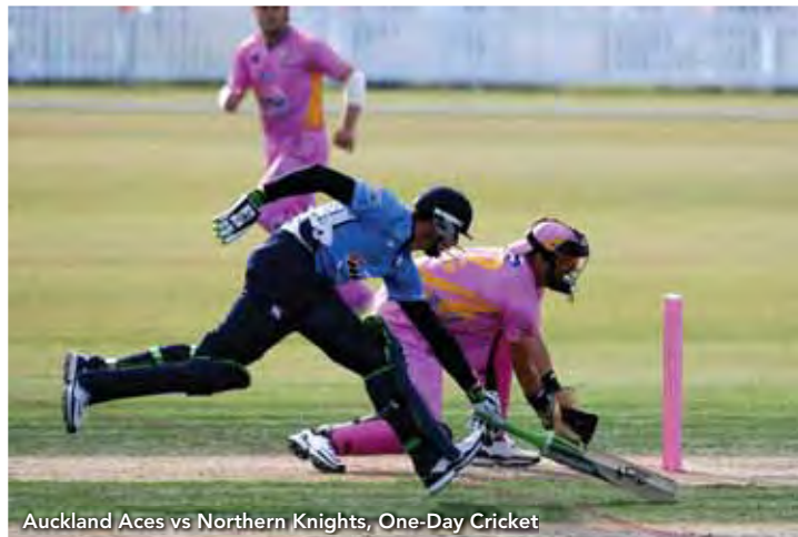
Auckland Aces vs Northern Knights, One-Day Cricket

Venue: Auckland Botanic Gardens, 102 Hill Road, Manurewa, 09 267 1457, www.aucklandbotanicgardens.co.nz