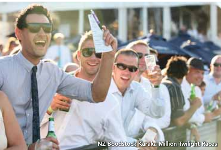
NZ Boodstock Karaka Million Twilight Races