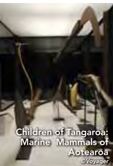
Children of Tangaroa: Marine Mammals of Aotearoa