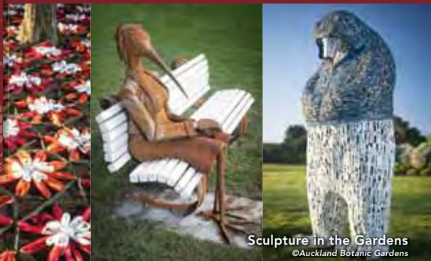
Sculpture in the Gardens