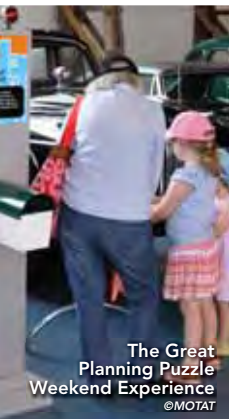
The Great Planning Puzzle Weekend Experience