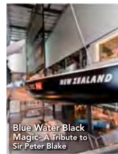
Blue Water Black Magic- A Tribute to Sir Peter Blake

Venue: Voyager New Zealand Maritime Museum, Corner Quay & Hobson Streets, Viaduct Harbour. www.maritimemuseum.co.nz