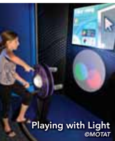
Playing with Light