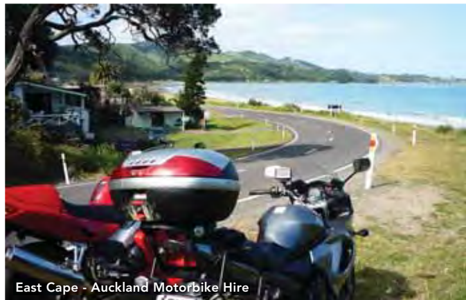
East Cape - Auckland Motorbike Hire