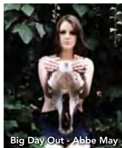
Big Day Out - Abbe May