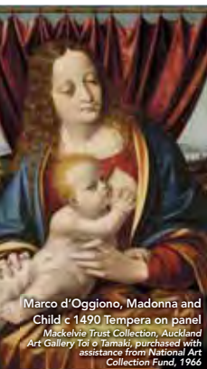
Marco d'Oggiono, Madonna and Child c.1490 Tempera on panel Mackelvie Trust Collection, Auckland Art Gallery Toi o Tamaki, purchased with assistance from National Art Collection Fund, 1966