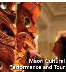
Maori Cultural Performance and Tour