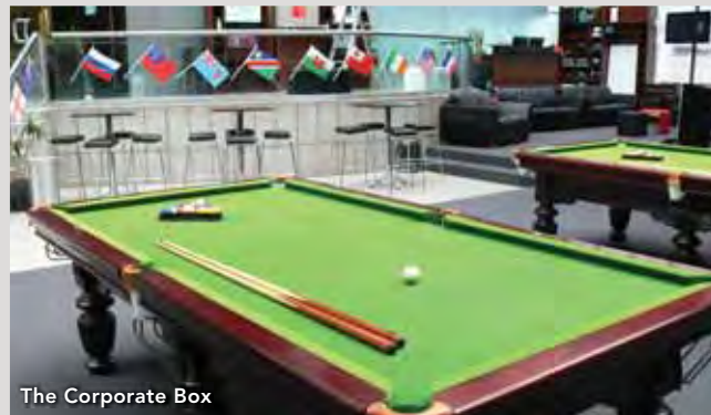
The Corporate Box