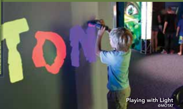
Playing with Light