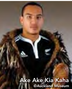
Ake Ake Kia Kaha