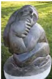
Sculpture in the Gardens