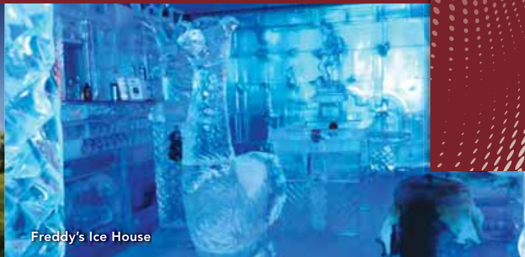
Freddy's Ice House