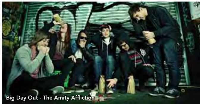
Big Day Out - The Amity Affliction