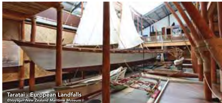
Taratai - European Landfalls

Venue: MOTAT, 805 Great North Rd, Western Springs. www.motat.org.nz