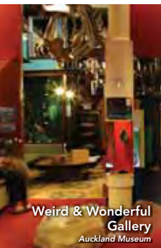
Weird & Wonderful Gallery Auckland Museum