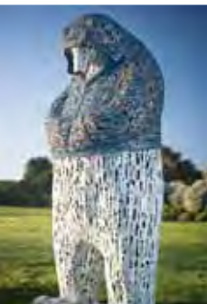
Sculpture in the Gardens