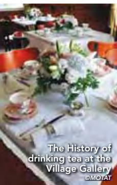
The History of drinking tea at the Village Gallery