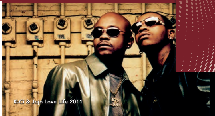
K-Ci & Jojo Love Life 2011